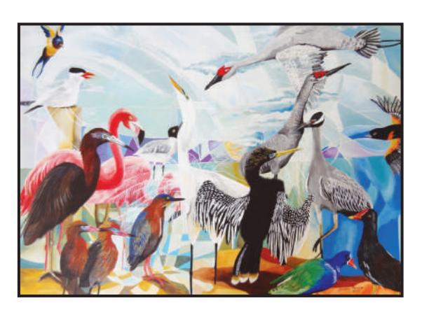
Isabel Perez 2013