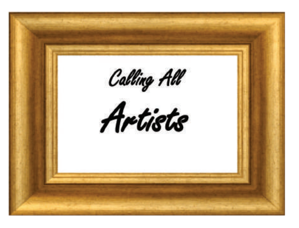
Your Name Here 2024